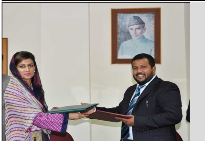
Hon. Minister of Commerce & Industry of Sri Lanka had bilateral meeting with Hon. Minister of Commerce of Pakistan (left) and Hon. Minister of Economic Affairs of Pakistan (right) on 5 July 2011.