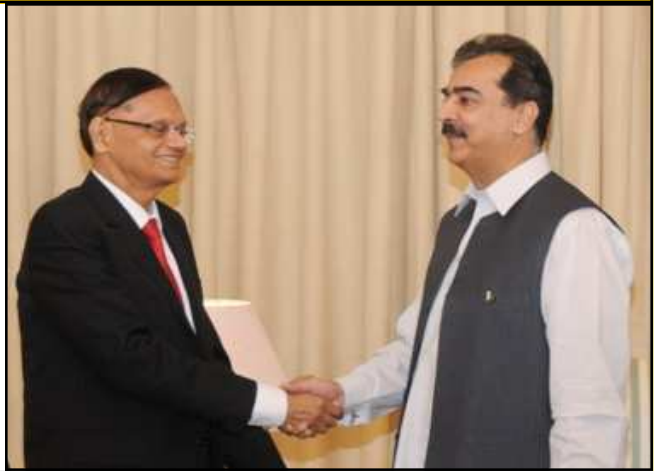
Prof. G L Peiris, Minister of External Affairs of Sri Lanka called on President Asif Ali Zardari at President's House (left) and Prime Minister Syed Yousuf Raza Gilani at Prime Minister's Office (right) of Pakistan on 15 July 2011