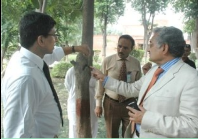
The Expert Team is examining the Dengue breeding places, Tyres, water canals, stagnant water vessels in Lahore.