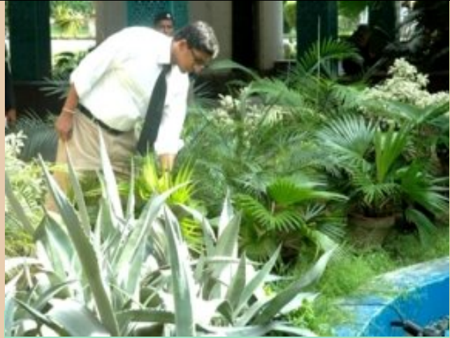
Examination of plants, ponds and flower pots, roof tops.