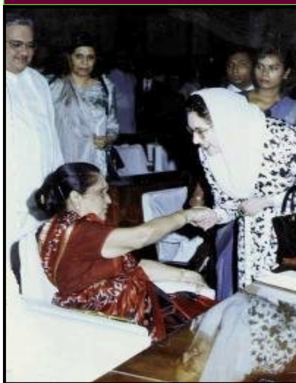
Former Pakistan Premier Madam Benazir Bhutto is being welcomed by Prime Minister Madam Sirimavo Bandaranaike in Colombo, Mr. Anura Bandaranaike Son of Mrs. Bandaranaike also in the picture (July 1997)