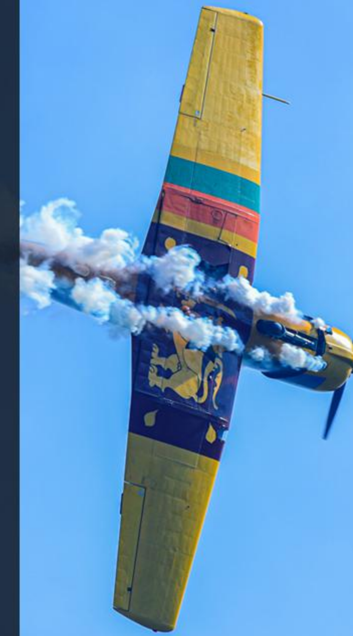
AEROBATICS AND AIR DISPLAYS