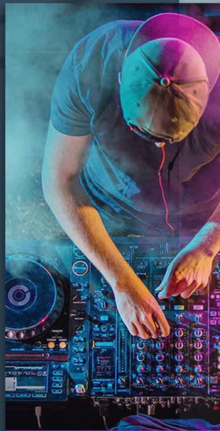
DJ AND DISCO