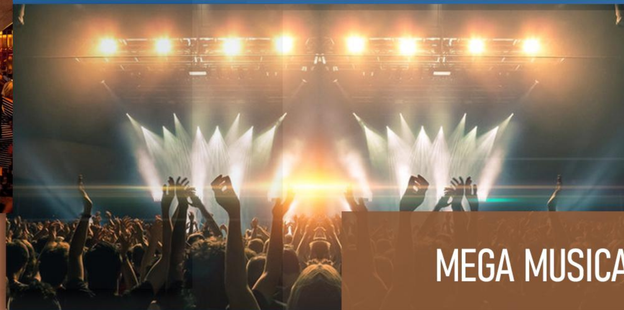
MEGA MUSICAL SHOWS