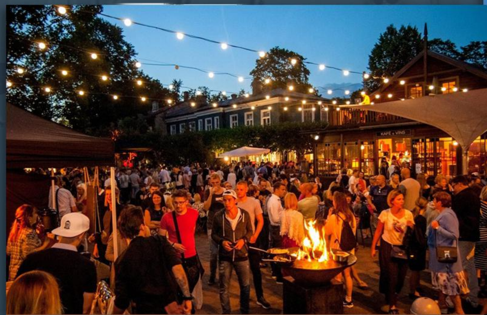
INTERNATIONAL FOOD FESTIVAL

AIRSHOW AND EXHIBITION RECREATIONAL PARK