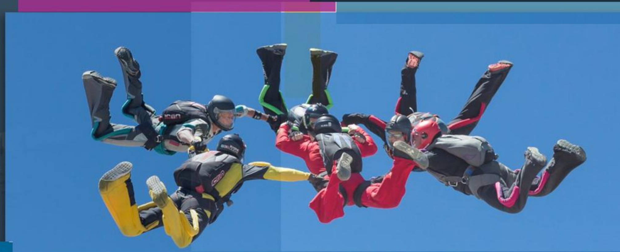
SKY DIVING AND TANDEM JUMPS